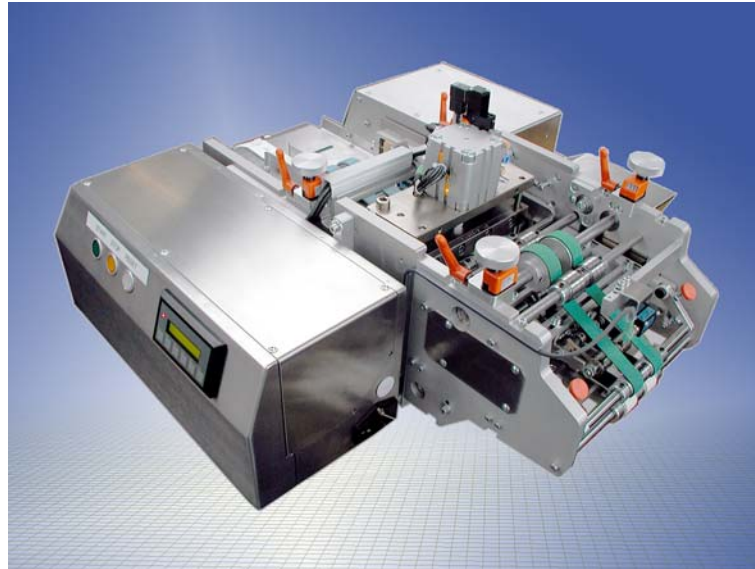
Pouch Cutter for linked bags separation of desiccant, product samples, etc.