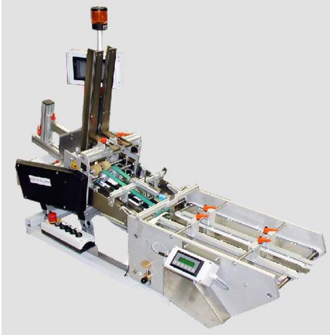
LHP feeder, plus booklet module with own servo drive