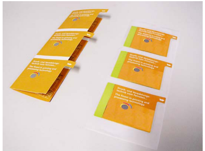
Booklet open and laminated

The booklet module is characterised by its compact design and short changeover time. Up to 30,000 labels per hour can be produced. The module is delivered as standard module for all labelling machines.